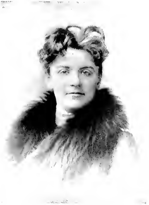
ADA C. REHAN.

Raymond and Lawrence Barrett, playing Ophelia, Desdemona, Celia, Olivia and other Shakespearian rôles. In 1878, while playing in "Katherine and Petruchio" in Albany, Augustin Daly met her and